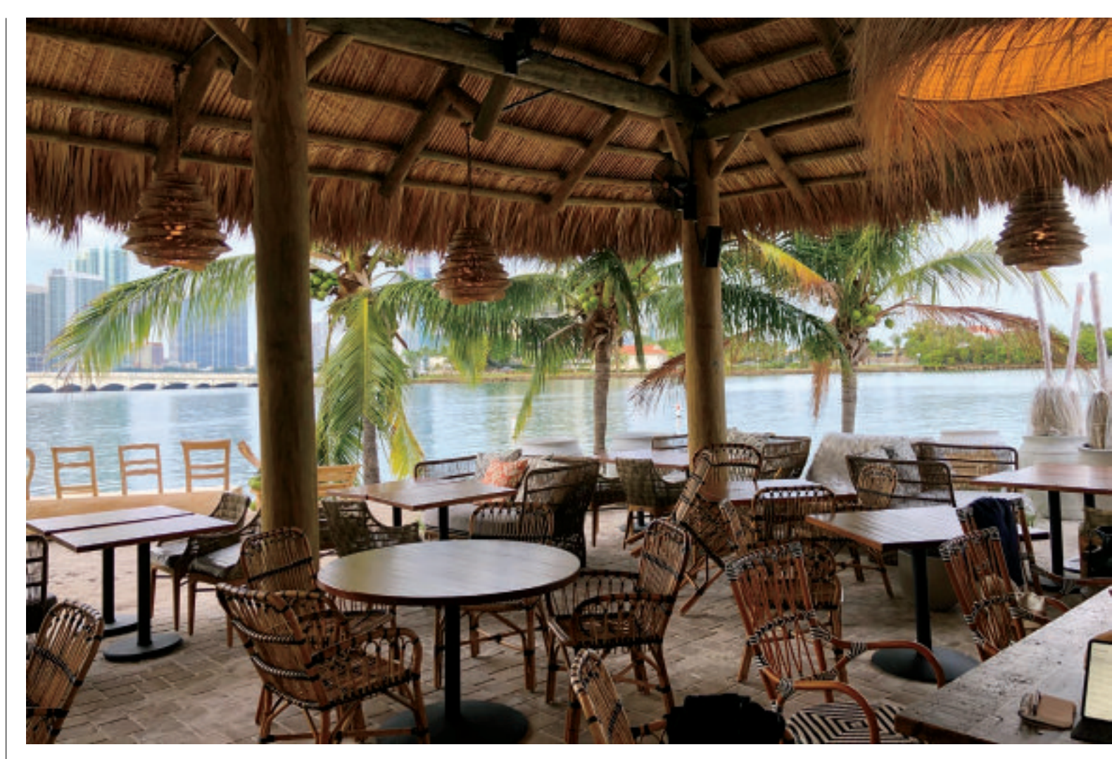
Joia Beach 1111 Parrot Jungle Trail, Miami

EVOKING THE VIBRANT Spirit of European beach clubs, this secluded enclave on Watson Island is Miami's hidden gem for day-tonight dining and entertainment. The bayfront destination, located near downtown Miami, is favored by locals and visitors for romantic dinners or indulgent celebrations. Before reaching the 45,000-square-foot property, guests enter along a path of lush jungle greenery. A private beach decorated with daybeds and teepees surrounds the 120-seat dining area under a thatched-roof tiki hut, while live DJ sets keep spirits elevated past sundown. The culinary program, led by Argentine chefs Gustavo and Maximiliano Vertone, features dishes like coal-roasted tiger prawns and crispy lobster tails, which pair perfectly with refreshing hand-crafted cocktails such as the signature Pure Joia (mezcal, pineapple syrup and tequila). joiabeachmiami.com