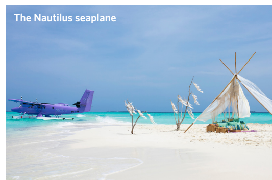
The Nautilus seaplane