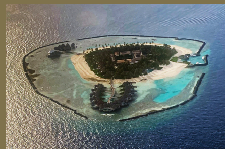
Samantha Coles enjoys a bird’s-eye view of The Nautilus Maldives via the resort’s cushy seaplane.