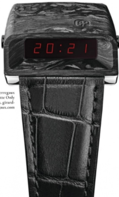
Girard-Perregaux Casquette Only Watch, girard-perregaux.com