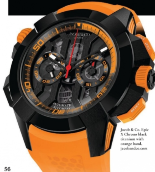
Jacob & Co. Epic X Chrono black titanium with orange band, jacobandco.com