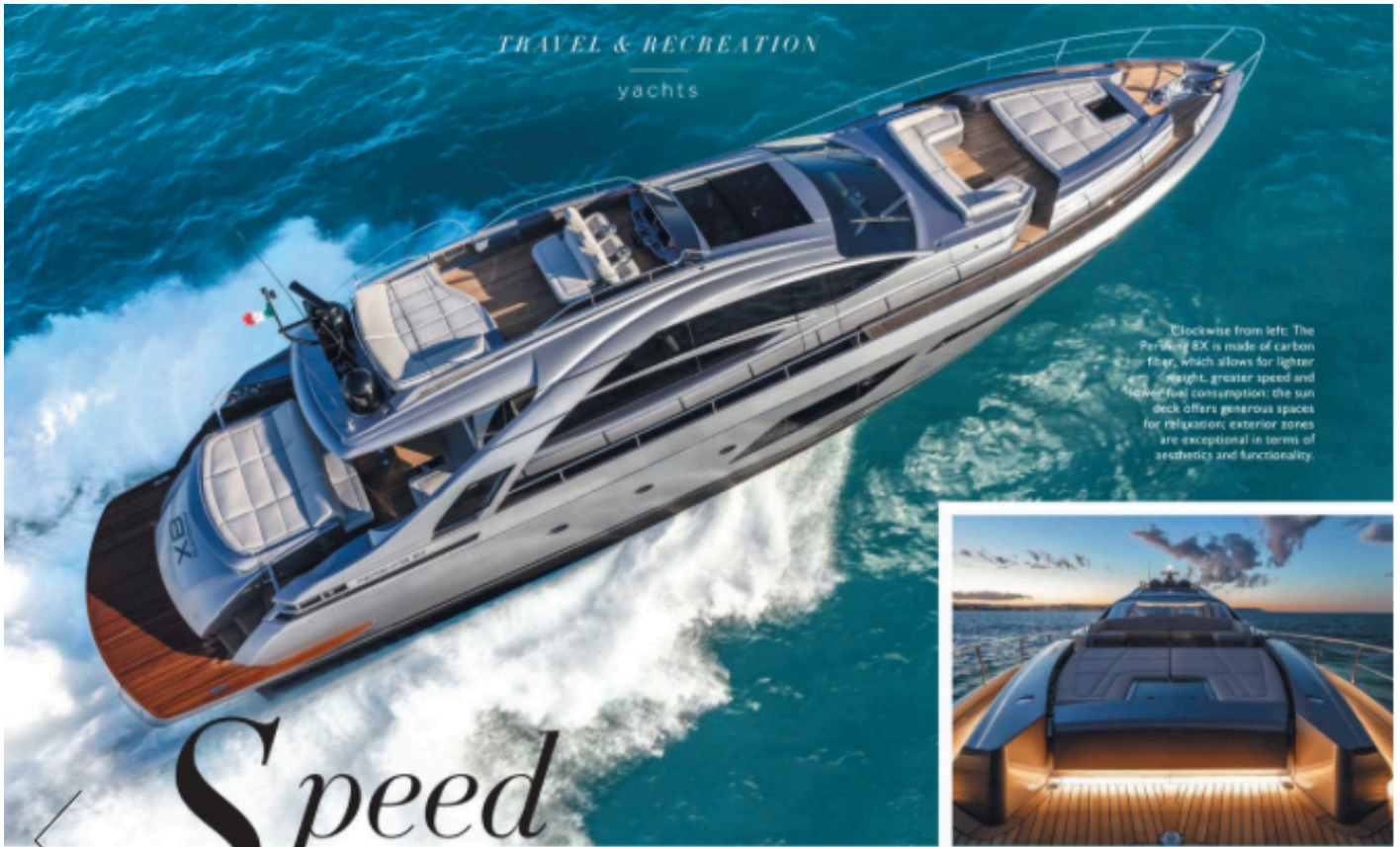
Clockwise from left: The Pershing 8X is made of carbon fiber, which allows for lighter weight, greater speed and lower fuel consumption; the sun deck offers generous spaces for relaxation; exterior zones are exceptional in terms of aesthetics and functionality.