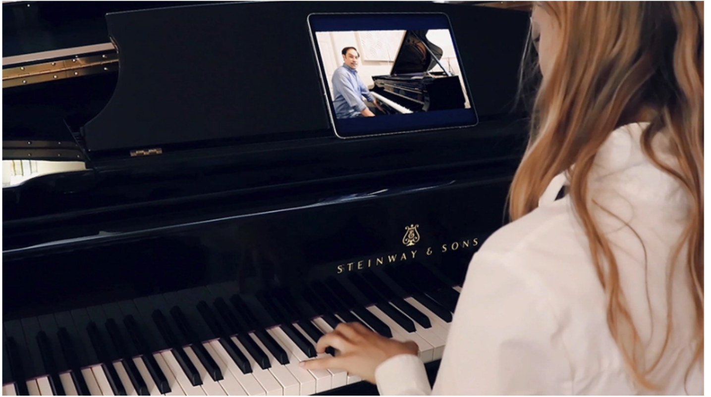
Steinway & Sons