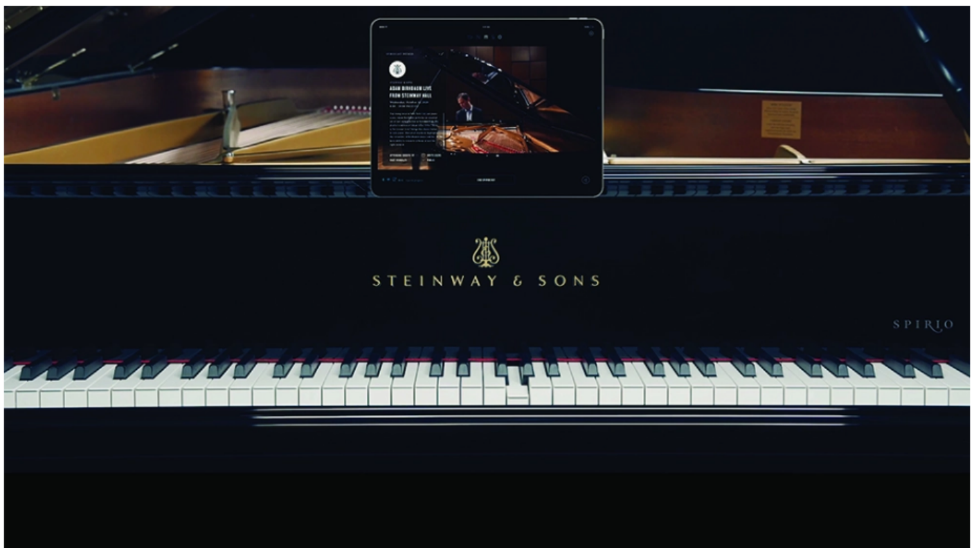
Steinway & Sons