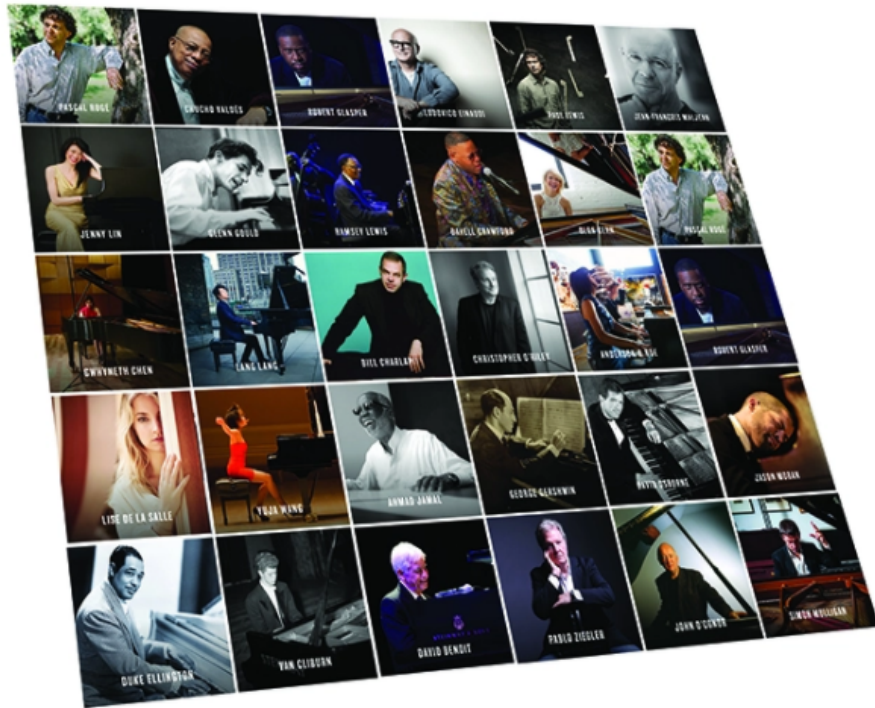
Steinway & Sons