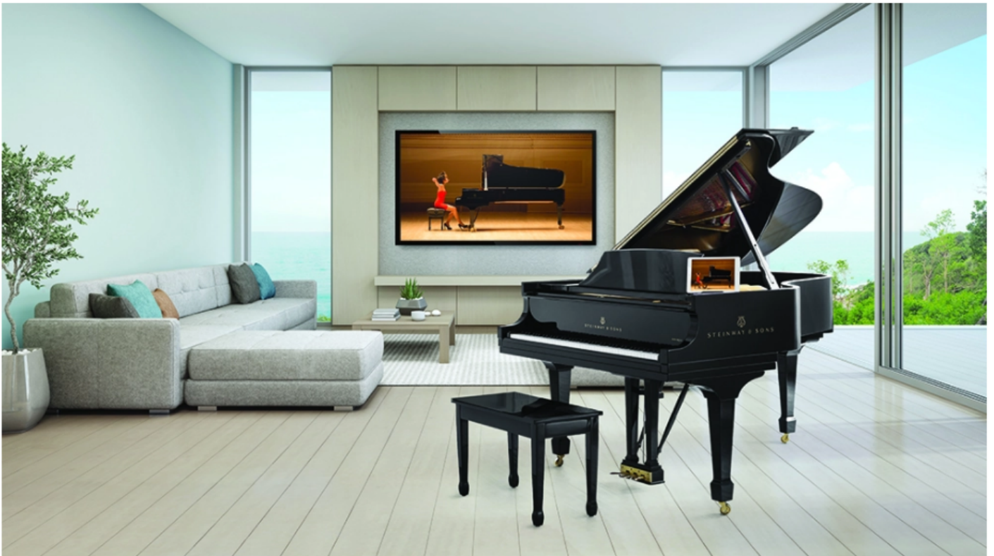
Pick your artist and listen to them play. Steinway & Sons

The innovative sensor system, which is completely hidden from view, precisely captures the movements of the hammers and pedals to recreate an identical acoustical experience on all pianos receiving the cast, according to Steinway. Furthermore, the video and audio of each performer is captured via the included iPad and broadcast in sync with the music.