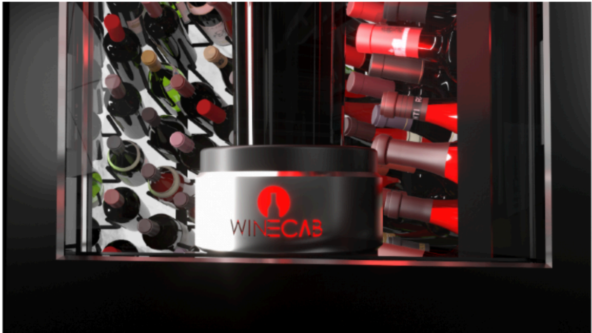
A close-up of the WineWall.