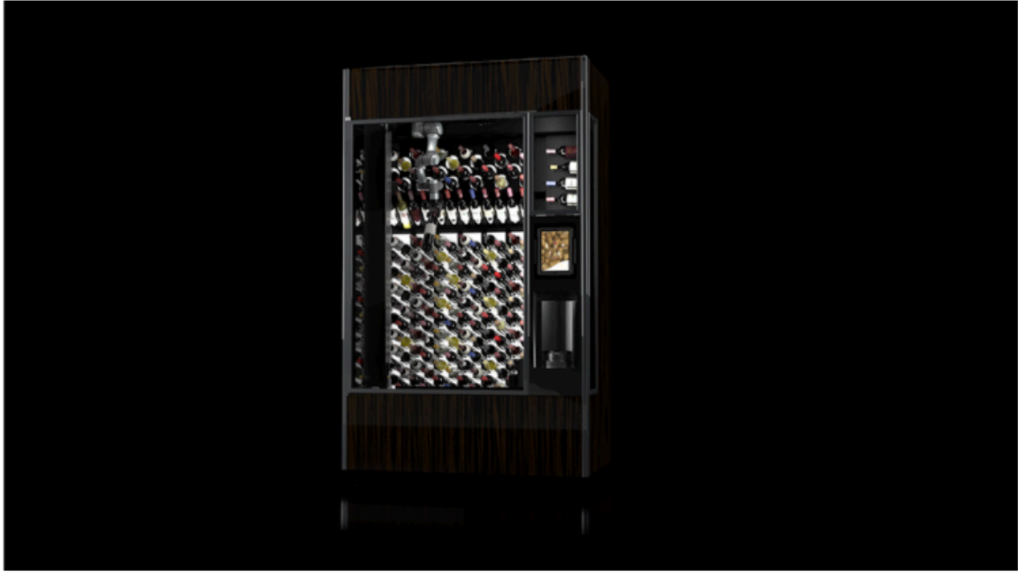
The 6-foot WineWall. WineCab

Check out more photos of the WineWall below: