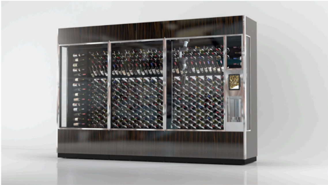
The 15-foot WineWall. WineCab