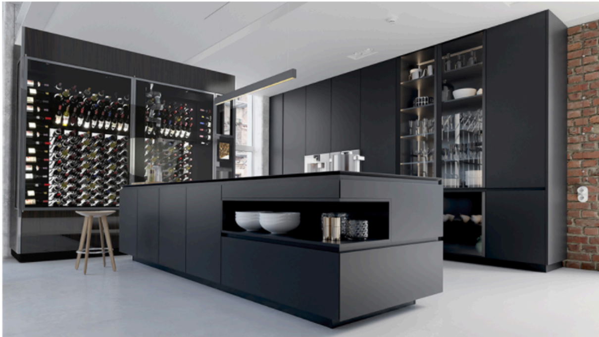
The 11-foot WineWall. WineCab

At the heart of the setup is a seven-axis, high-speed robotic arm that loads, scans and dispenses wines, while three cameras track its movement. WineCab says this is the first time such robotic technology has been introduced into a residential setting, and it's further enhanced by facial-recognition software that identifies users and environmental controls that keep your bottles at the correct temperature and humidity. The WineWall is also fitted with motion sensors is to safeguard your bottles.