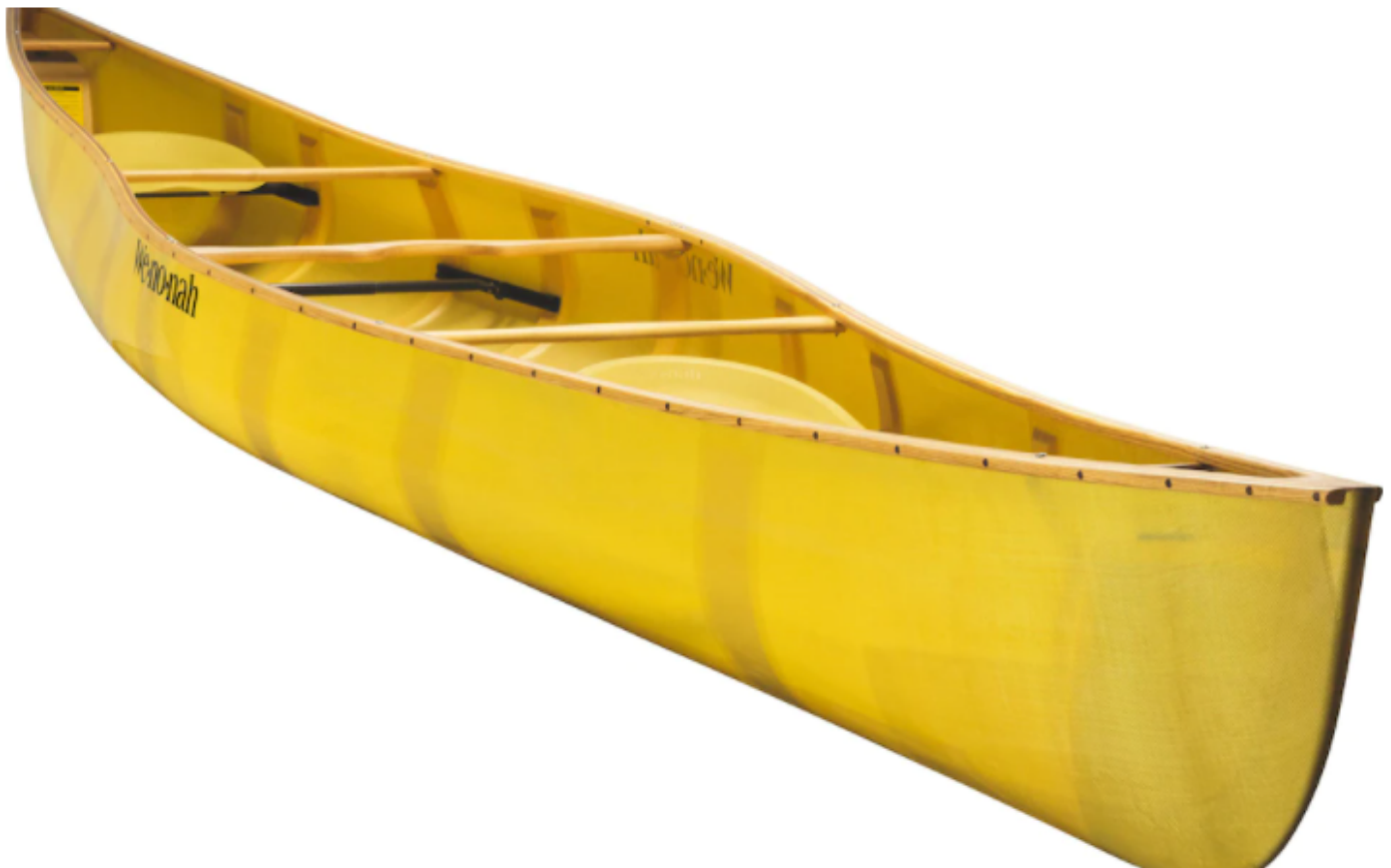
Itasca, Wenonah's hand-crafted canoe

About as far as you can get from a garish plastic kayak, Wenonah has been hand-crafting canoes on the banks of the Mississippi river in Minnesota for 50 years – and turns out seriously smart boats.