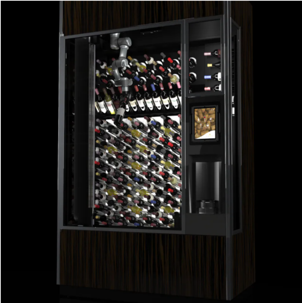
WineCab's WineWall, a digital wine cellar

You may not be able to replicate the cool caverns of a cellar on a yacht, but you can still keep your vintages in perfect condition. Winecab's WineWall is a digital "cellar" with temperature control, a wine management system for up to 600 bottles and a robotic arm to dispense them.