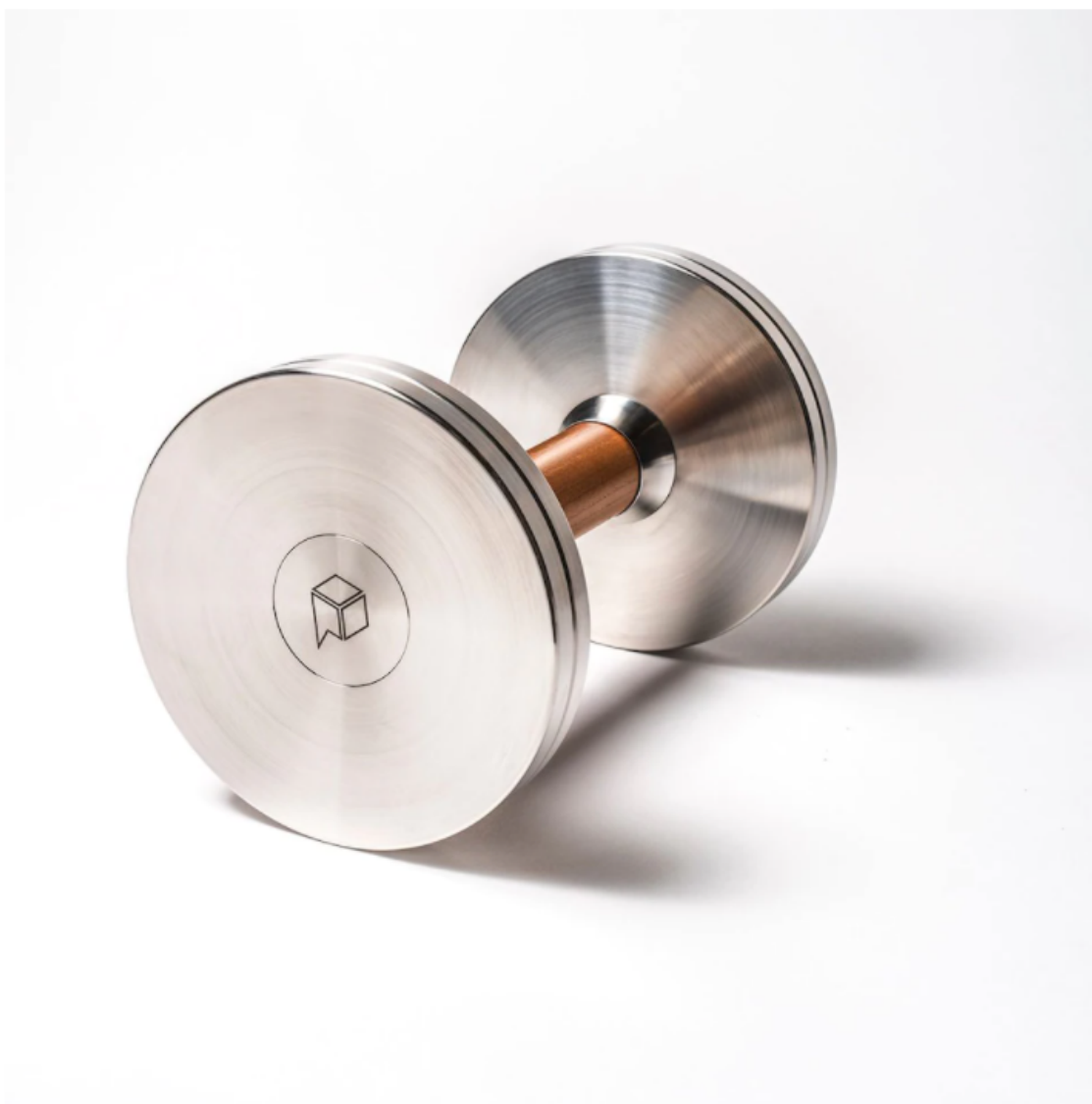
Diabolo Dumbell, sold as part of a set